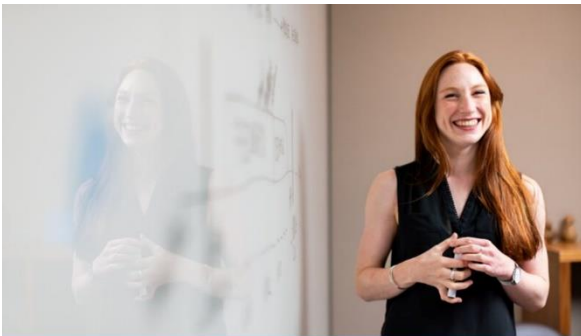
Why knowing how your adult education organisation performs in CPD matters