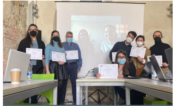
A resourceful meeting in the treasure city of Mantua