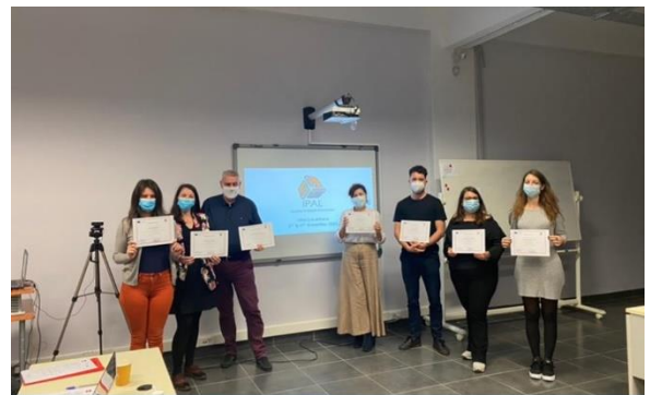
The 3rd IPAL transnational meeting in Athens