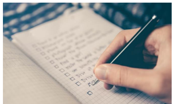
Monitoring of CPD